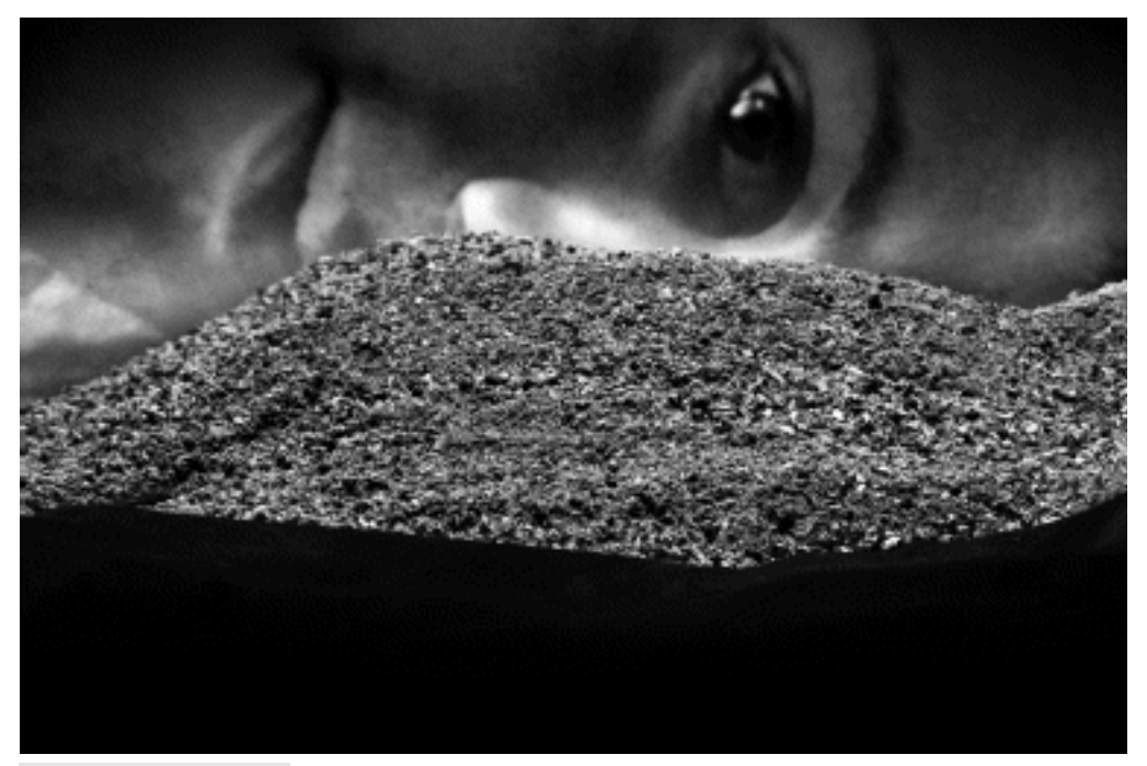
PowerPoint slide Original jpg (35.00KB) Display full size

Grief is hard grinding work, but the photographs in Released confront the reality of that grief in a truly unique way. The very fact of photographing these ashes may seem sacrilegious to some, and the way in which Jimmy has spread them over close ups of Josh's image are heavy with complicated emotions. But they also show how it is possible to move away from the intensity of such loss and to create a lighter space where a continuing relationship with the deceased can grow and develop.