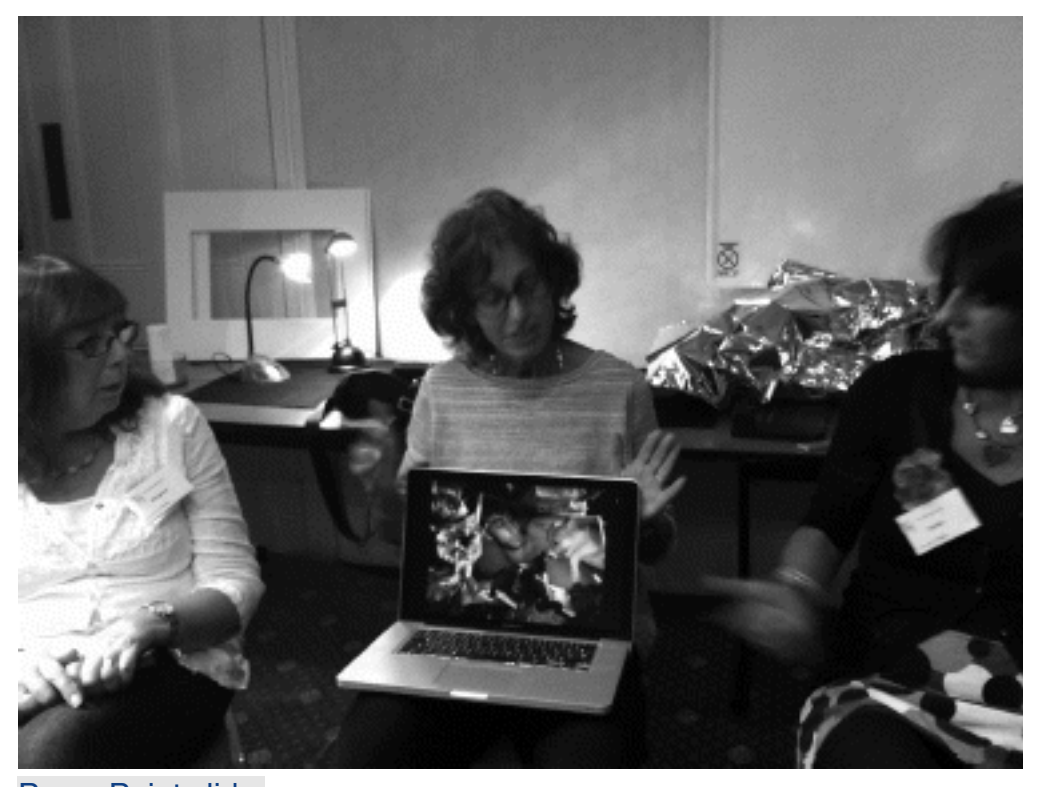
PowerPoint slide Original jpg (35.00KB) Display full size

Exploring Grief with Photography workshop