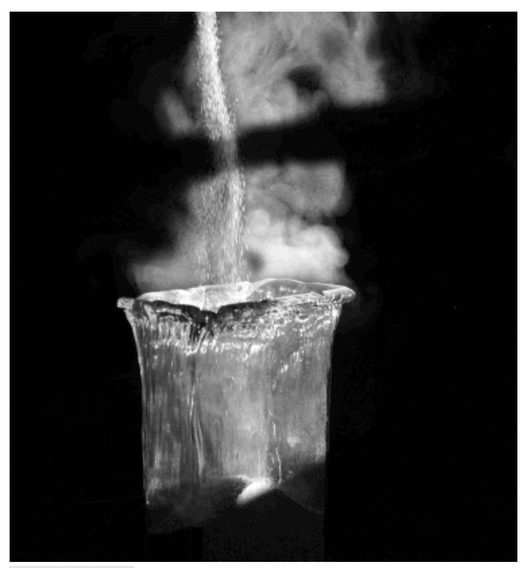
PowerPoint slide Original jpg (38.00KB) Display full size

The living Josh of whom this is a photograph had no idea that his image would be seen in this way, but we now engage with him (eye to eye so to speak) as if he did. Released – Ash cloud § 6