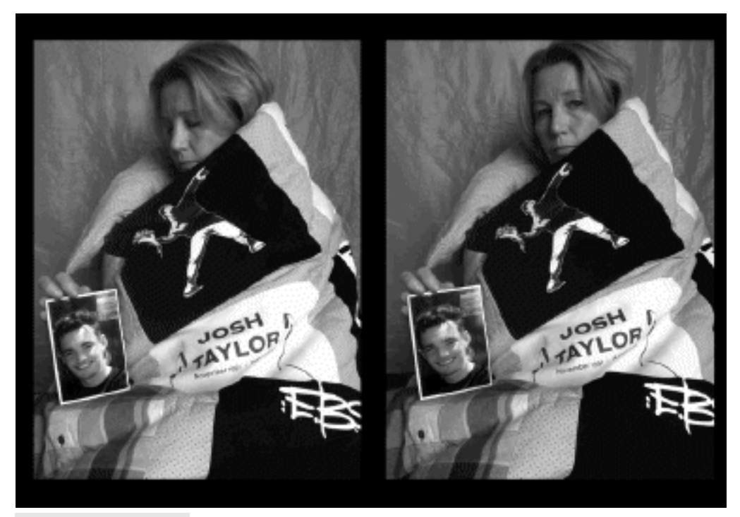
PowerPoint slide Original jpg (35.00KB) Display full size