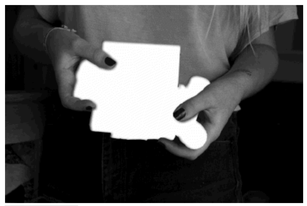
PowerPoint slide Original jpg (18.00KB) Display full size

These ideas of a 'continuing bond' and a 'shared grief' inform much of our current work. We believe that the hard work of grief is best rewarded through acts of making things, of finding ways to interpret and record one's continuing relationship with the deceased. As Jane writes: 'Bereavement and loss are transformative experiences and as such are extremely fertile ground for creative expression whether this ties in with an attempt to challenge the silence that often accompanies death, or a purely personal catharsis.'